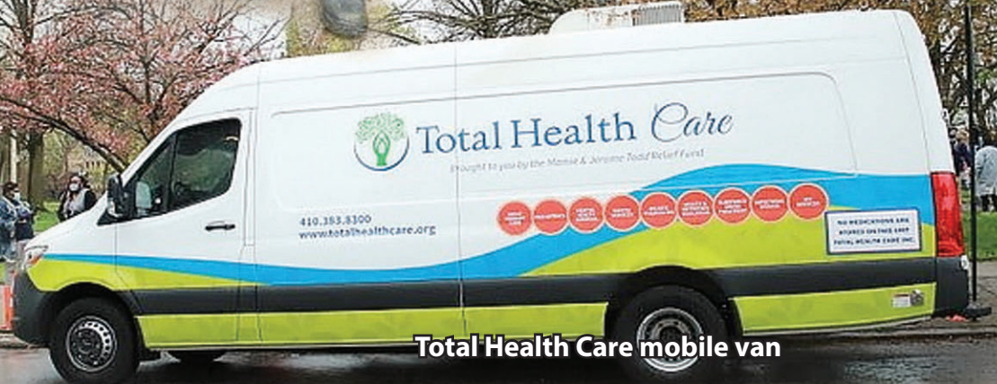
Total Health Care mobile van