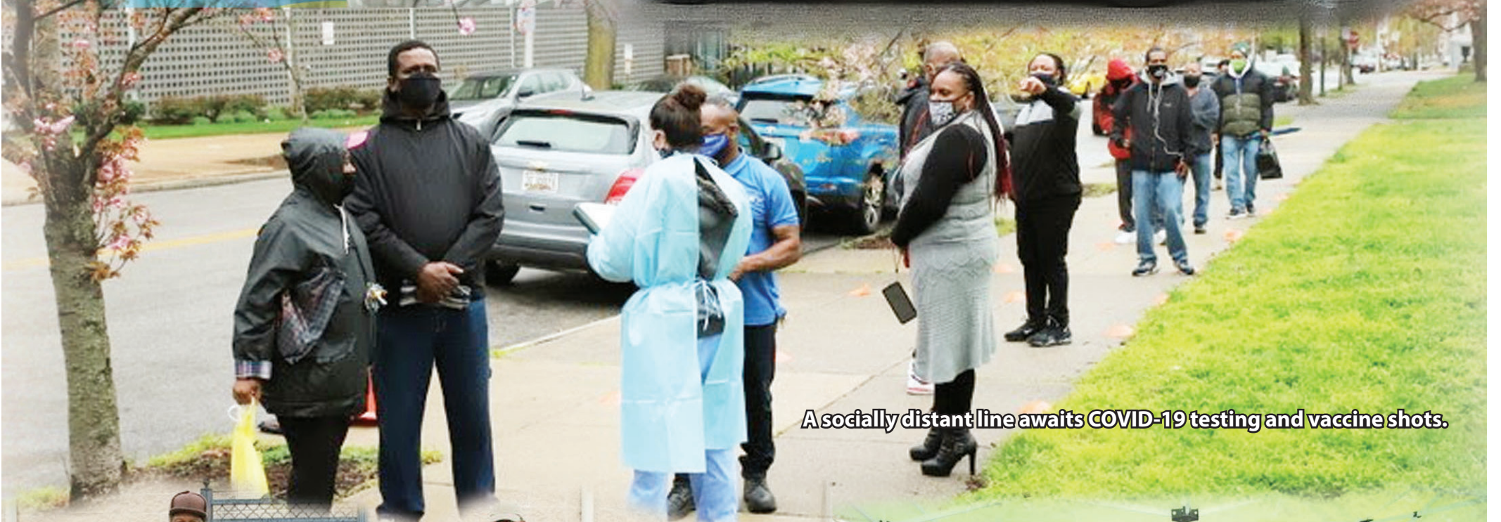
A socially distant line awaits COVID-19 testing and vaccine shots.