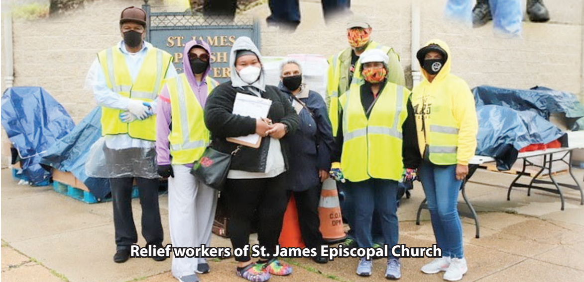
Relief workers of St. James Episcopal Church